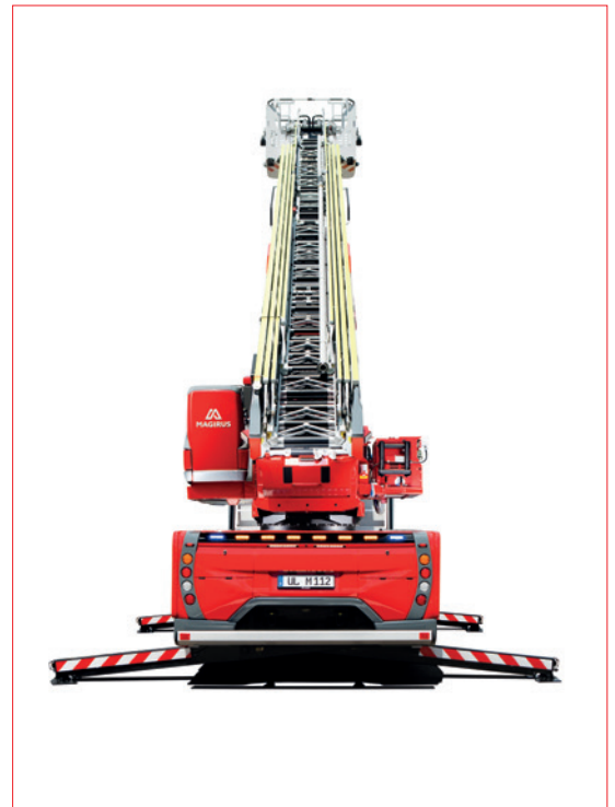
VARIO jacking system

Illustrations may include additional options. We reserve the right to make technical changes or improvements at any time without prior notice. Errors and omissions excepted.