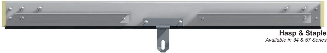
Hasp & Staple Available in 34 & 57 Series