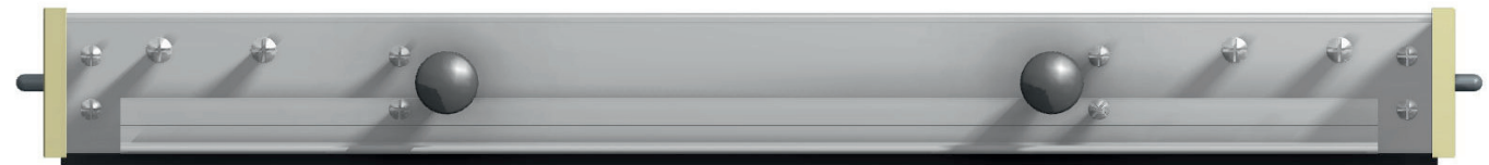
Knob Lock Available in 34 & 57 Series Min W.O.C = 600mm Max W.O.C = 1600mm