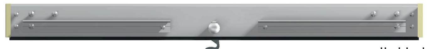
Hook Lock Available in 34 & 57 series