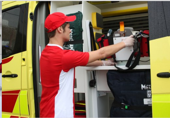
Place for defibrillator