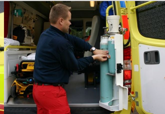
Turnable oxygen cylinder holder