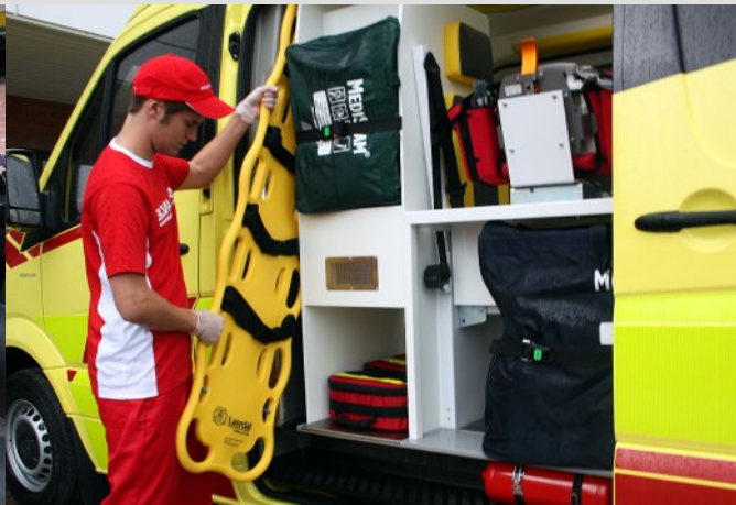
Left side sliding door equipment