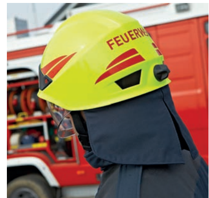
157002 / 157064 / 1568906 / 1570917