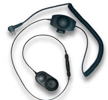
15665612 / 15665405