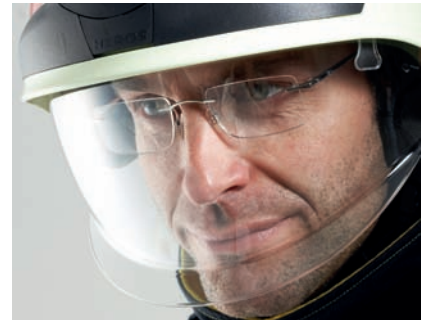
Extensive facial protection

Both visors are also suitable for wearers of spectacles