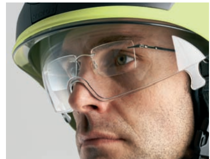
Separate, swivel eye protection visor**

Visors tested and certified as to EN 14458:2004 .