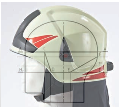
HEROS-xtreme: Full shell