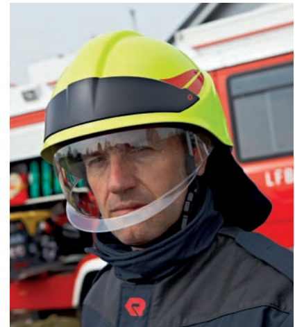
157002 / 15685001