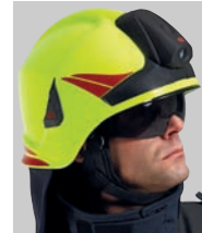
15685401 / 156849 / 156864