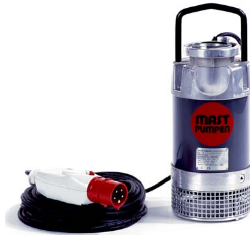
pump. head H m