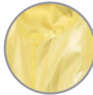
The suit material is a combination of chloroprene rubber and a multilayer barrier, providing excellent chemical resistance as well as abrasion and flame resistance