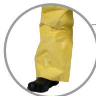
Attached boots or sewn-in socks in the suit material