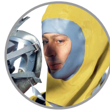
Anatomically designed face seal for optimum safety and comfort