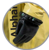
Bayonet glove ring system for quick and simple glove exchange