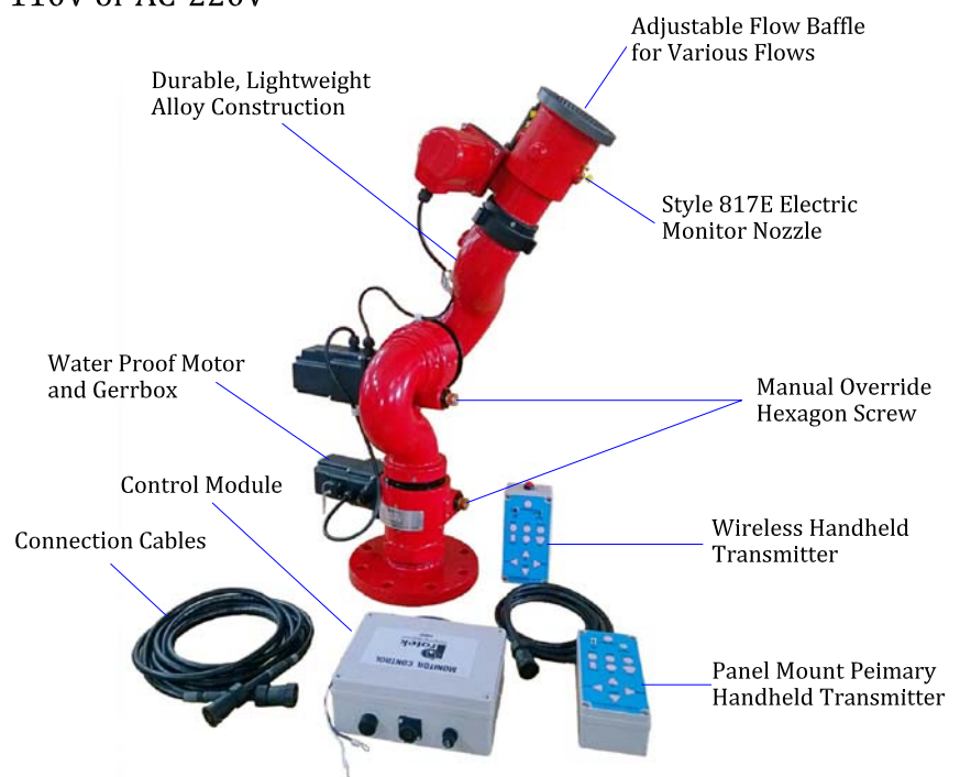
Style 933 monitor shown with standard accessories: Style 817E nozzle, control monitor, connection cables, primary transmitter and wireless transmitter