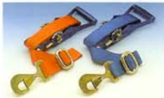
Ratchet belt, 2 m (6.6 ft.), orange 150 02 100 Ratchet belt, 2 m (6.6 ft.), blue 150 02 200 for LD 50/30 W