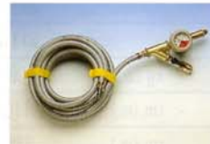
Inflation and safety hose 2.5 bar (36.25 psi) 144 14 000