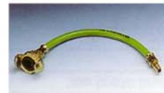
Quarry adaptor 160 18 000