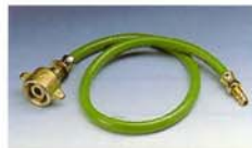
Mining adaptor R 32 x 1/8" 160 10 000