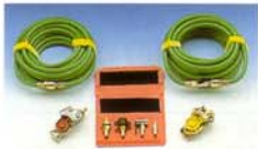
Universal connector kit 160 17 000