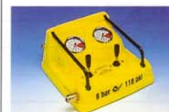
Dual deadman controller 8 bar (116 psi) plastic housing 123 12 000