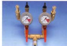
Dual fitting controller 2.5 bar (36.25 psi) 144 13 000