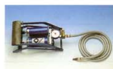
Foot pump with safety valve for 2.5 bar (36.25 psi) 146 73 000