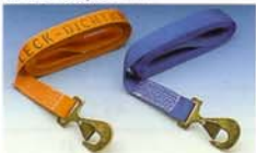
Standard belt, 5m (16.4 ft.), orange 150 03 100 Standard belt, 10m (32.8 ft.), blue 150 03 200 LD 50/30 W and DLD 50/30