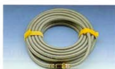
Inflation hose, 10 m (32.8 ft.), grey, with deflation nipple 144 20 000