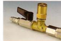
Ball valve 8 bar (116 psi) 131 10 000 (only for industrial use)