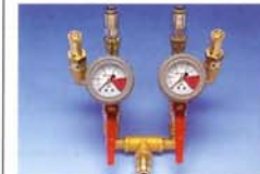
Dual safety controller 8 bar (116 psi) 123 15 000