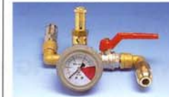
Single fitting controller 8 bar (116 psi) 123 14 000