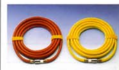
Inflation hose, 5 m (16.4 ft.), red 123 11 000 Inflation hose, 5 m (16.4 ft.), yellow 123 10 000 Inflation hose, 10 m (32.8 ft.), red 131 14 000 Inflation hose, 10 m (32.8 ft.), yellow 131 13 000