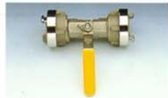
Shut-off unit, stainless steel, Storz D for DLD 50/30 und LD 50 VAC 157 02 000