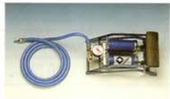
Foot pump with safety valve for 1.5 bar 158 05 000