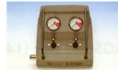
Dual deadman controller 2.5 bar (36.25 psi) plastic casing 144 12 000