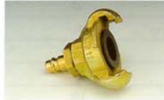
Adaptor for construction site compressor 160 13 000