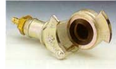
Railway compressed-air system adaptor 160 11 000