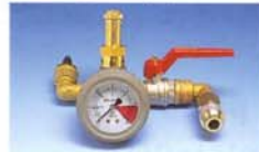
Single fitting controller 2.5 bar (36.25 psi) 144 11 000