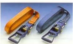
Tensioning and extension belt, 10 m (32.8 ft.), orange 156 03 100 Tensioning and extension belt, 10 m (32.8 ft.), blue 156 03 200 for LD 50/30 W, LD 50/30 S and DLD 50/30